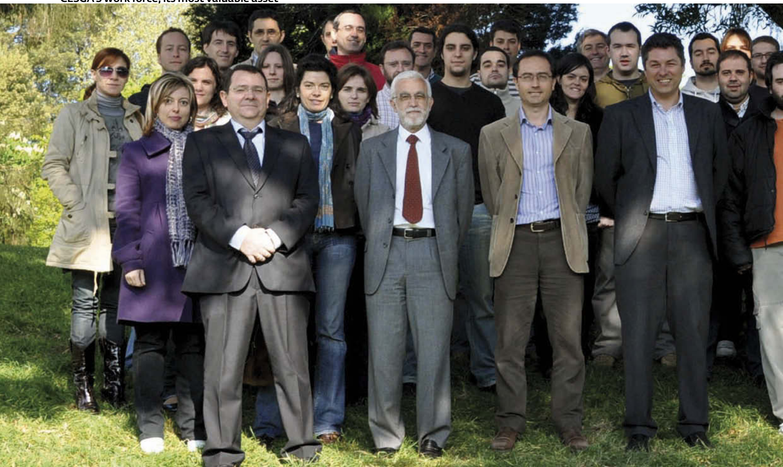
CESGA'S work force, its most valuable asset